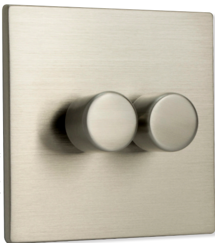
Hardhat CFX ® Satin Stainless